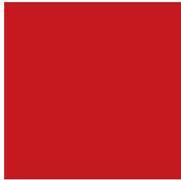
GIZ Red CMYK: 5, 100, 100, 15 RGB: 198, 49, 52

Used for text (s) in reports, publications, communication and marketing products.