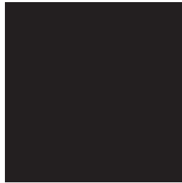
Black CMYK: 0, 0, 0, 100 RGB: 55, 52, 53