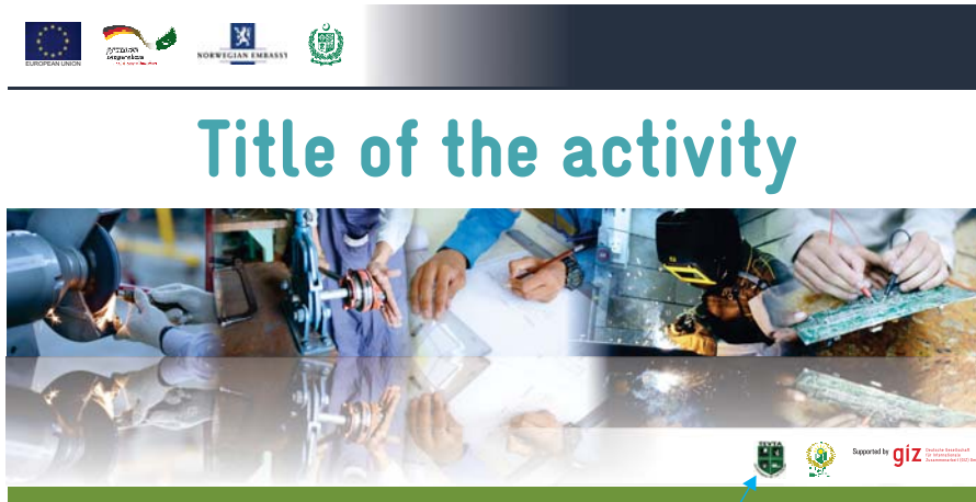
Logo of additional implementing partner appears here

Banners & signboards shall be produced only on need basis. Visibility of the TVET SSP and its donors shall be respected in the banners and signboards as well. Application of the standard text and colour scheme shall be ensured while producing any such products for any activity. The artwork of such products may be shared with Technical Advisor Communication TVET SSP for clearance at least 4-6 days prior to the activity. It is recommended to visit the venue to keep the colour scheme and measurements in consideration before designing and publication of any product.