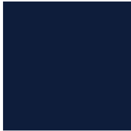
Deep Blue CMYK: 100, 90, 50, 50 RGB: 42, 51, 72